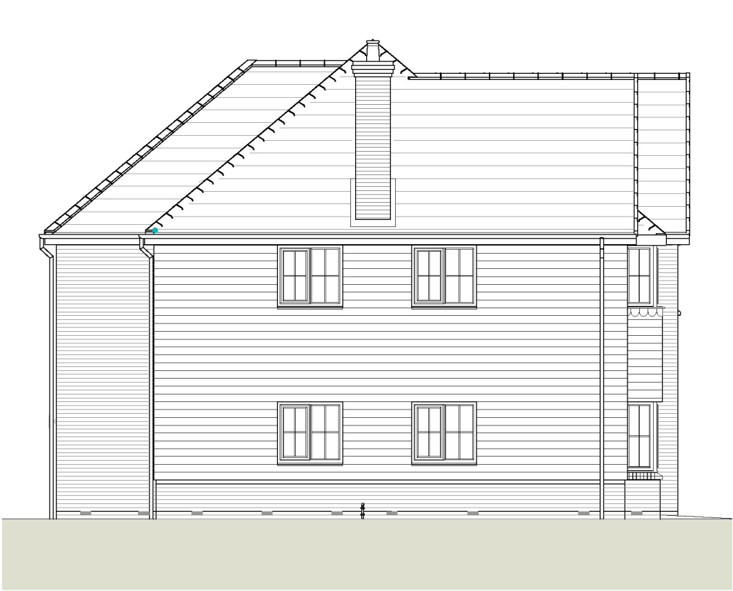
2 Gable Elevation 1 : 100