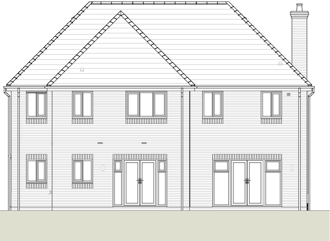
3 Rear Elevation 1 : 100