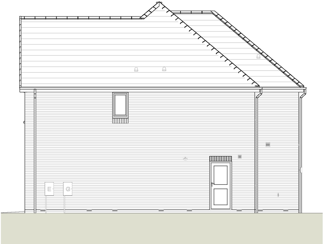
4 Gable Elevation 1 : 100