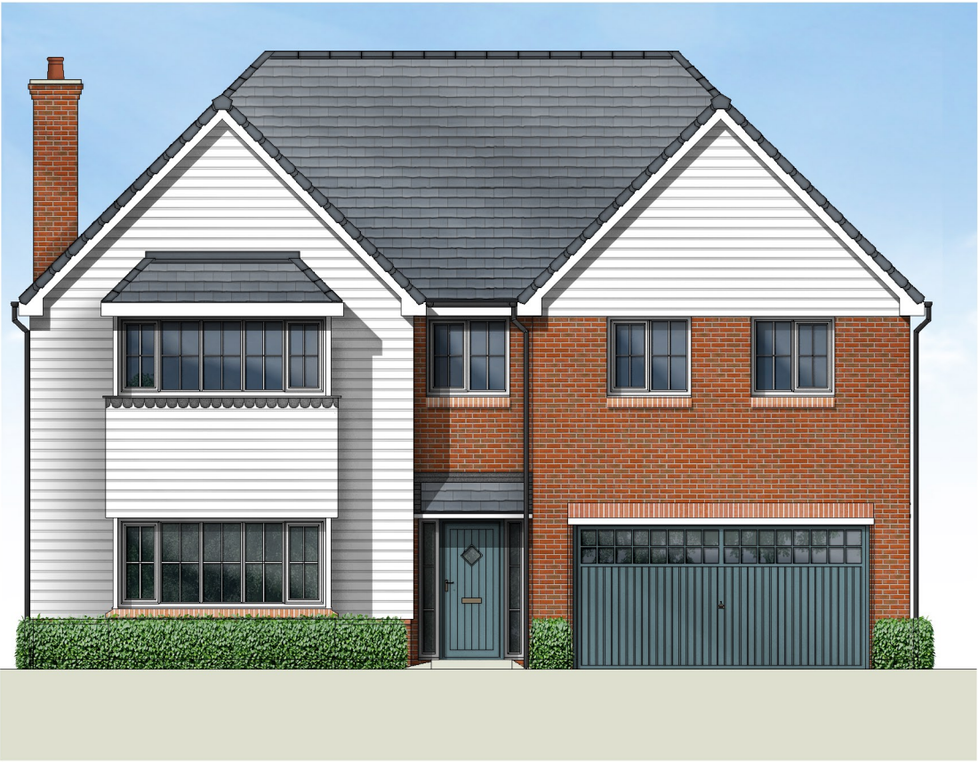
1 Front Elevation 1 : 100