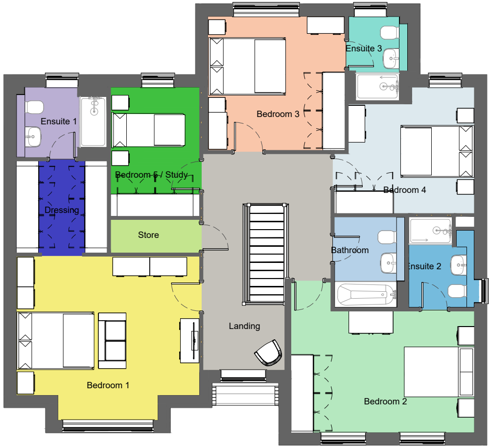
2 First Floor 1 : 100