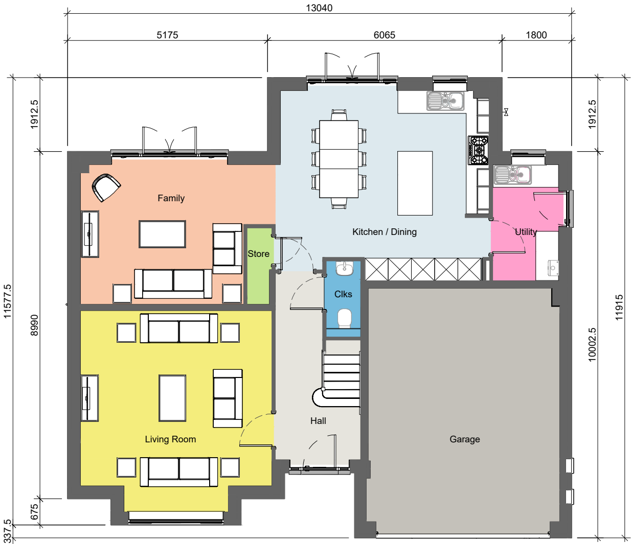
1 Ground Floor 1 : 100

Part O requirements:- Safety Rail to be installed at 1100mm, which may be omitted if Build Tolerance to window opening is within a range of maximum 1100mm and minimum 1000mm