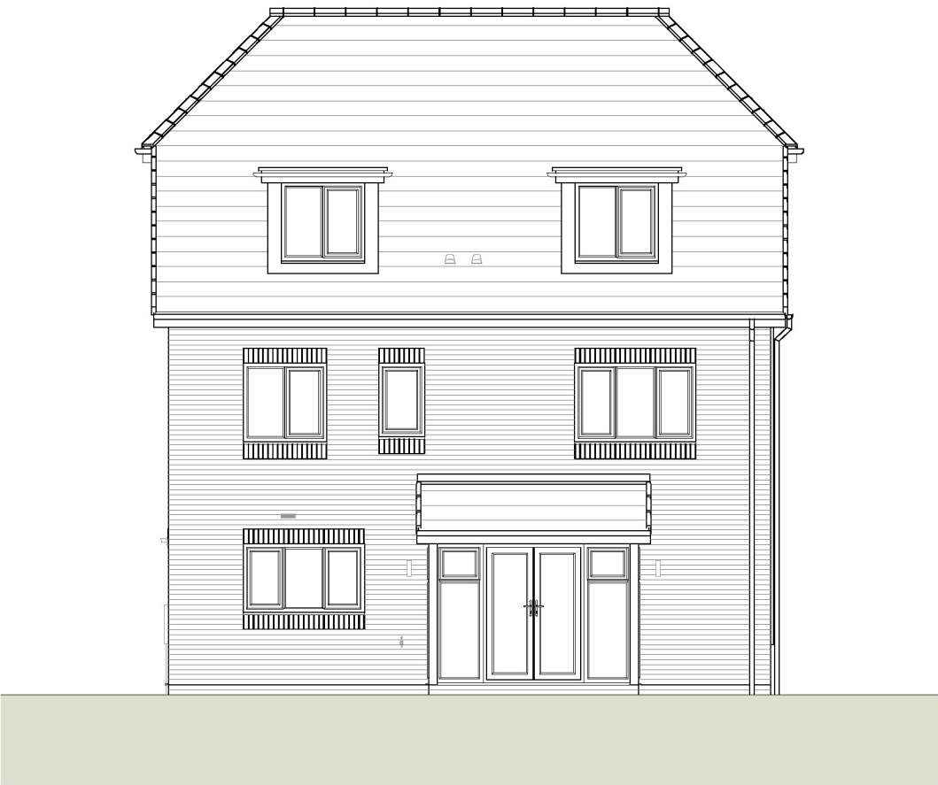
3 Rear Elevation 1 : 100