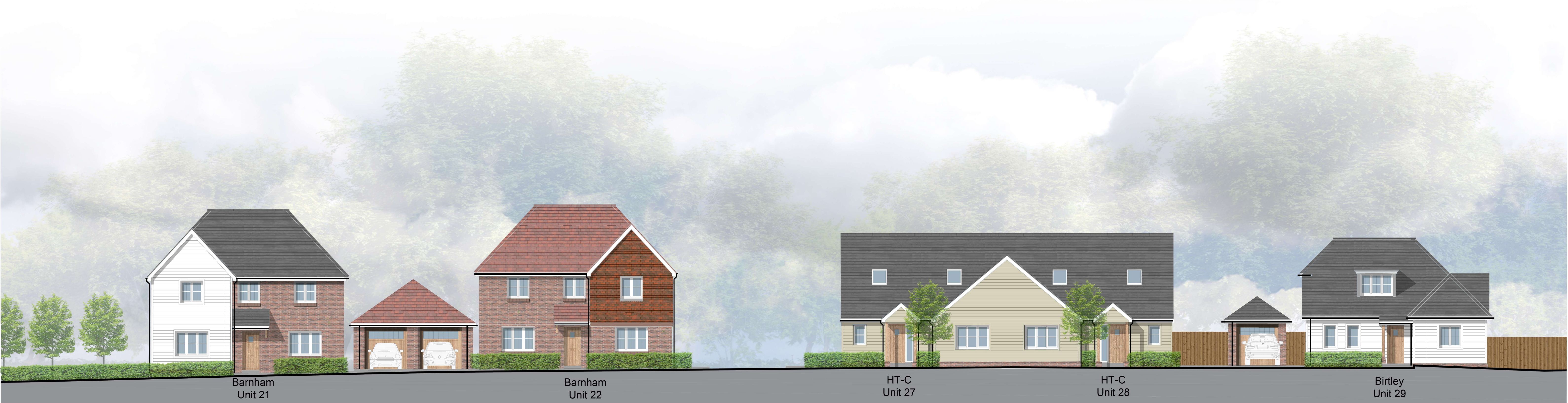
Street Scene Section F-F