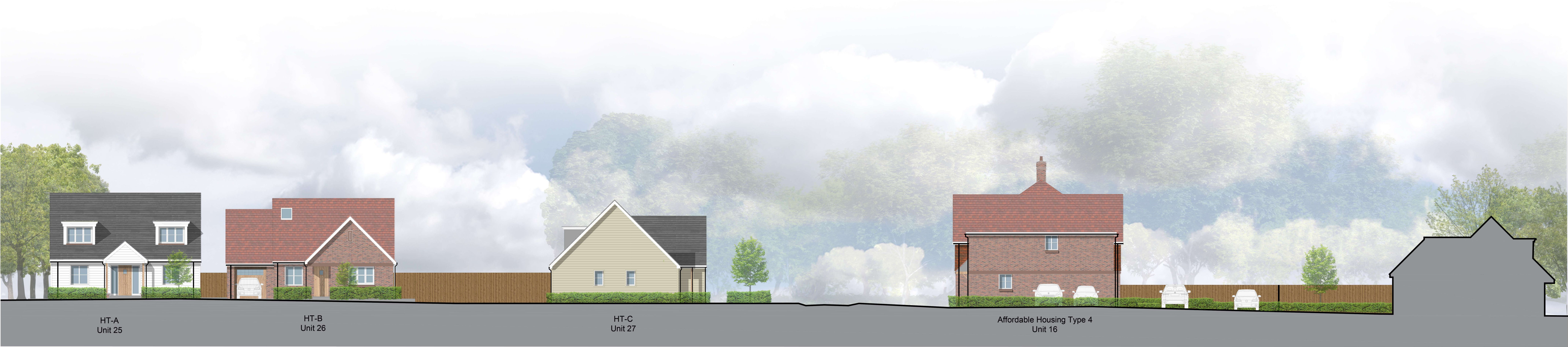
Street Scene Section D-D