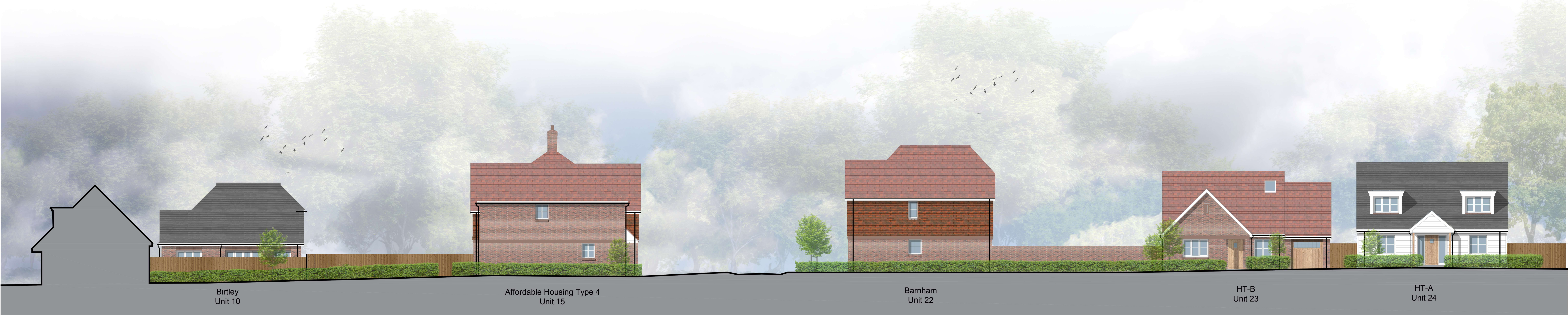
Street Scene Section E-E