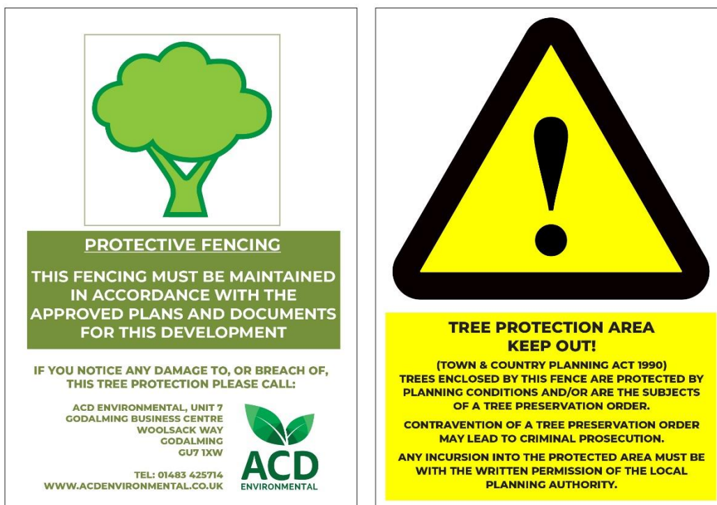
Figure 1: Tree Protection Sign (digital copies available for download at: www.acdenvironmental.co.uk )