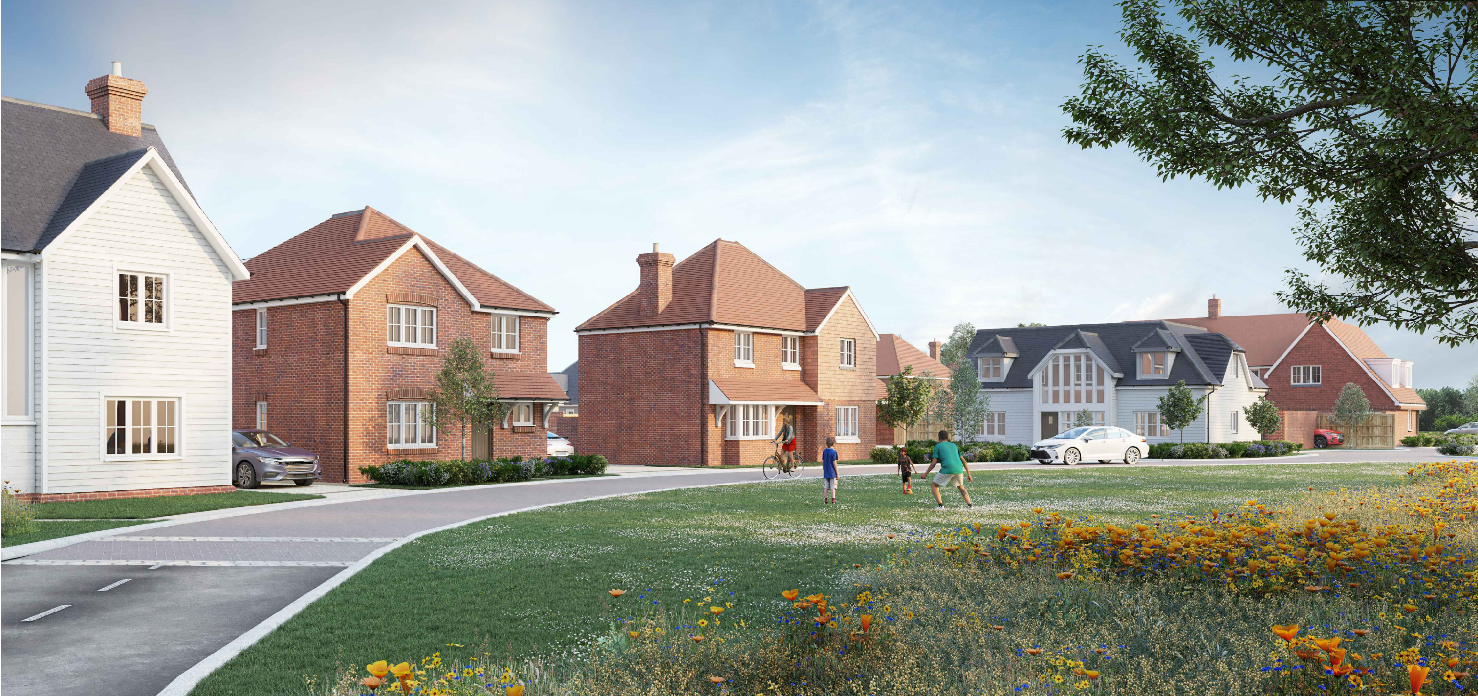
Indicative view of the site looking southeast from the site entrance.