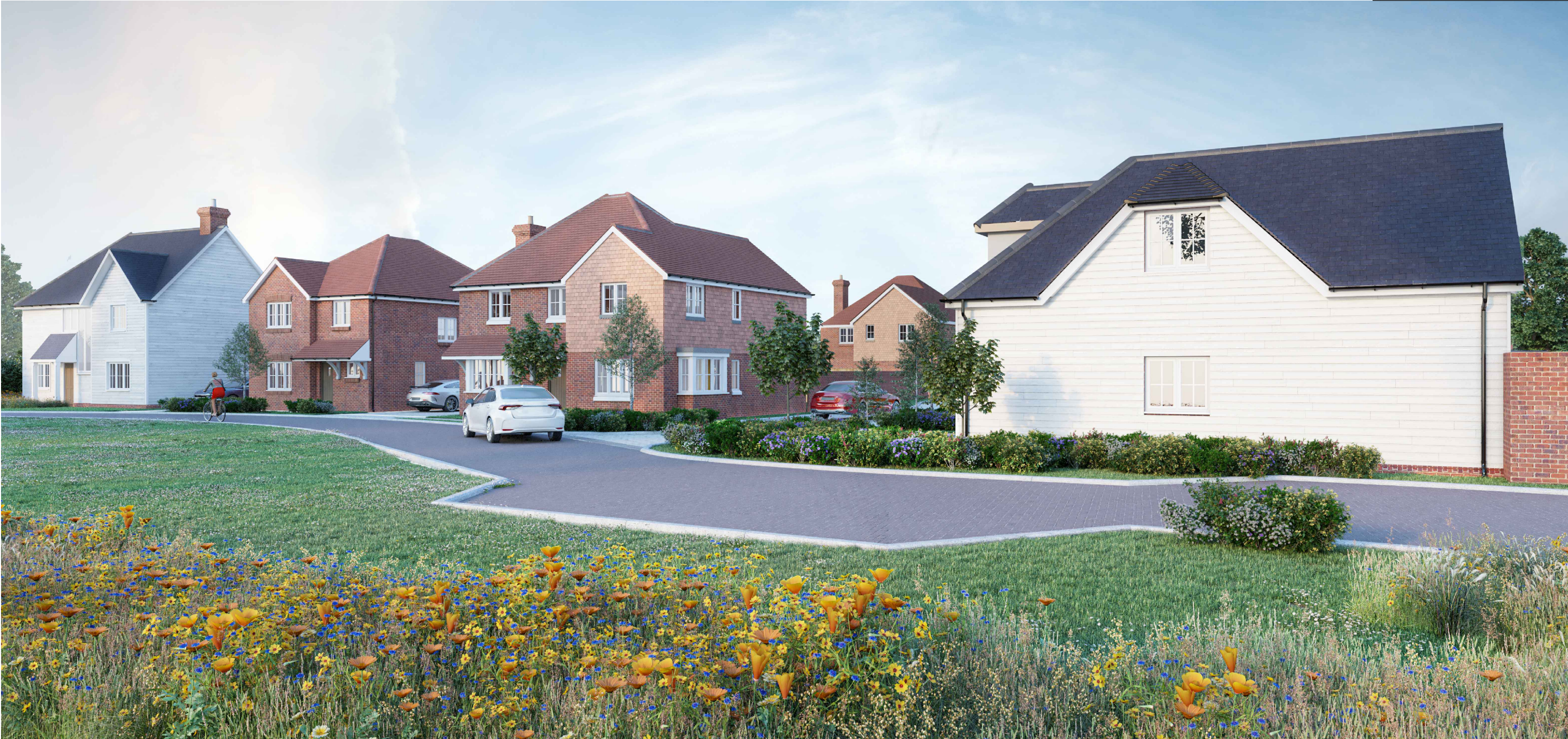
Indicative view of the site looking east from the public footpath.