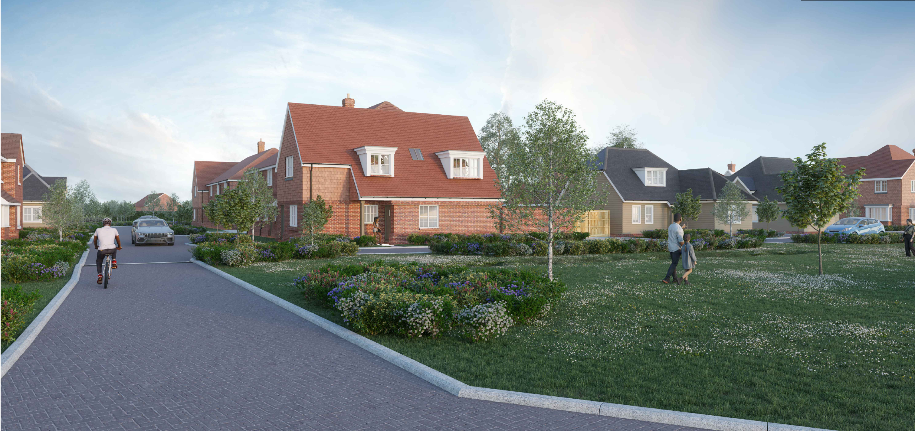
Indicative view of the site looking west from the public open space.