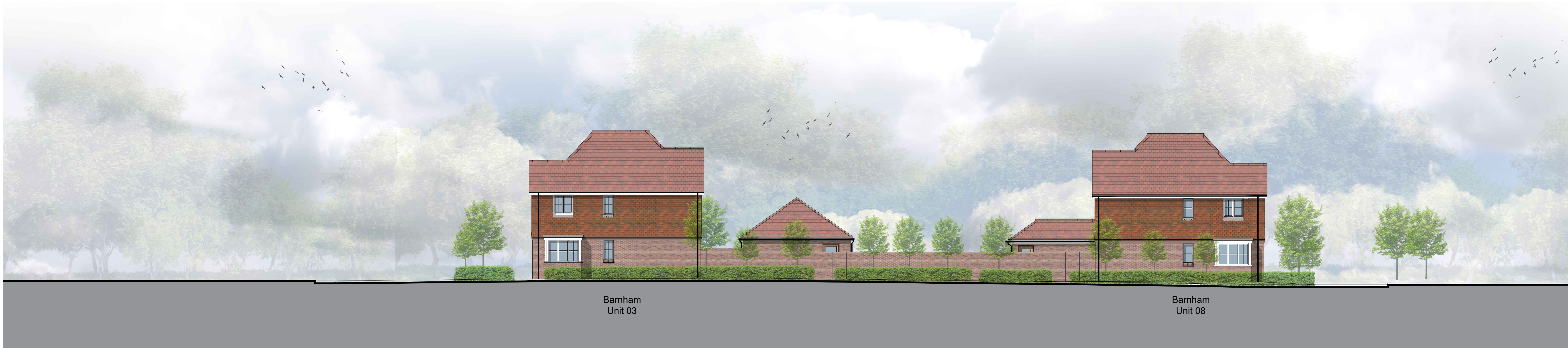
Street Scene Section G-G