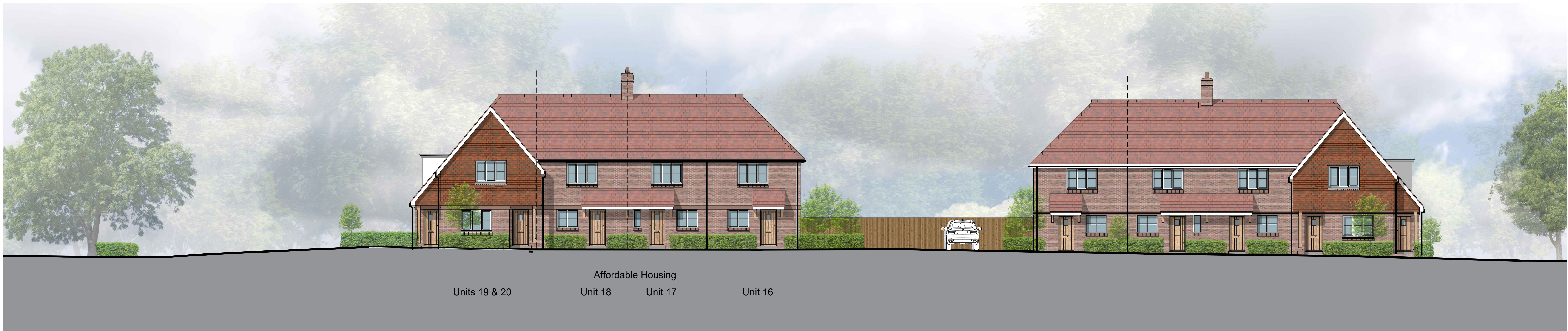
Street Scene Section H-H