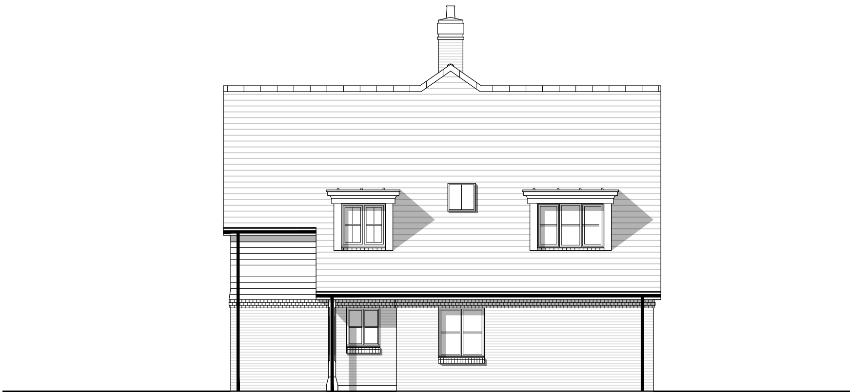
Side Elevation A