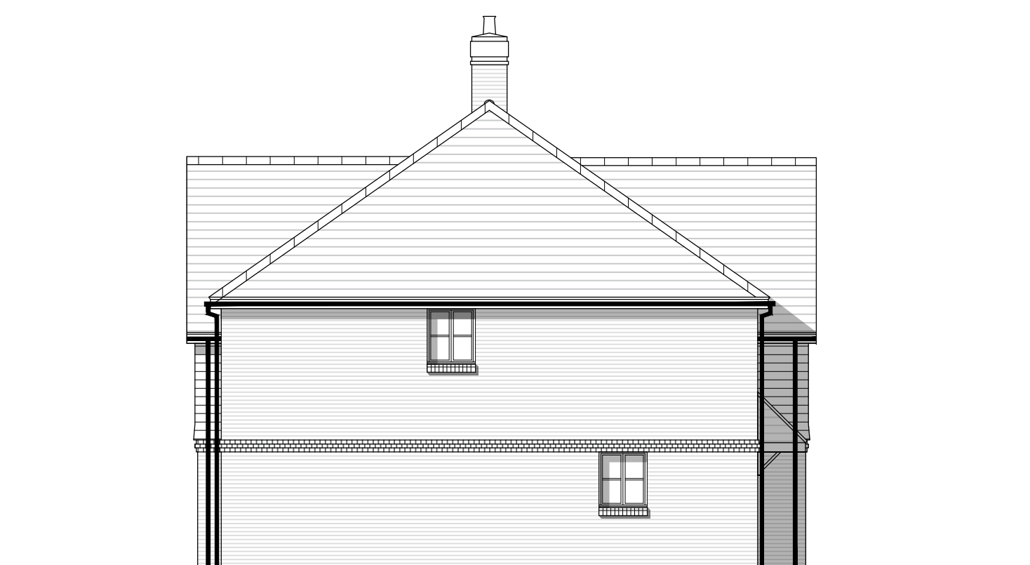
Side Elevation B

Type: Affordable Block Plots 11 & 19 1 Bed Flats 56.41sqm / 607sqft GIA [to finishes] A minimum of 1.5sqm storage provided in accordance with NDSS requirements. Plots 12 & 20 2 Bed Flats 66.60sqm / 717sqft GIA [to finishes] A minimum of 2.0sqm storage provided in accordance with NDSS requirements. Plots 14 & 17 2 Bedroom Houses 81.20sqm / 874sqft GIA [to finishes] A minimum of 2.0sqm storage provided in accordance with NDSS requirements. Plots 13, 15, 16 & 18 3 Bedroom Houses 93.20sqm / 1003sqft GIA [to finishes] A minimum of 2.5sqm storage provided in accordance with NDSS requirements.