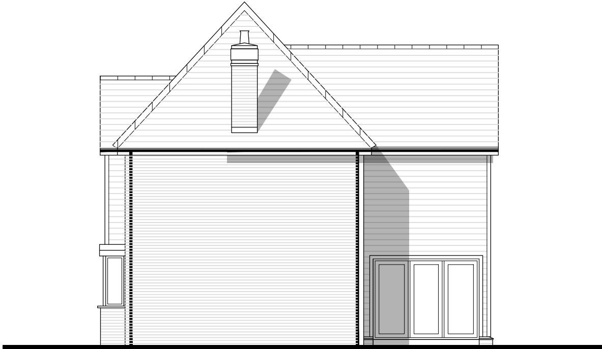
Side Elevation A