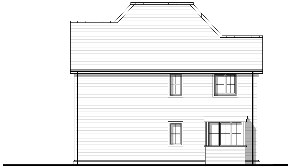
Side Elevation B

Note. For more information regarding proposed materials, please refer to PL06 - Materials Plan and the Design and Access Statement that accompanies this application.