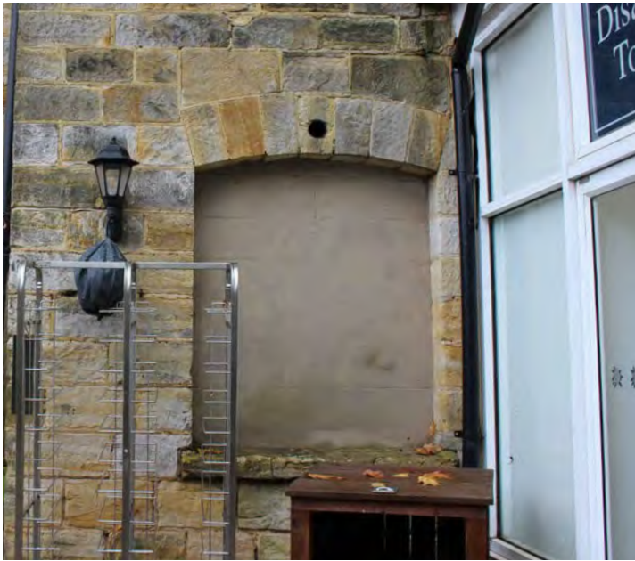
Existing blocked up historic window opening to be reinstated