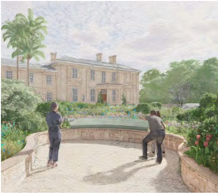
Additional interpretation boards to explain the history of Leonardslee House