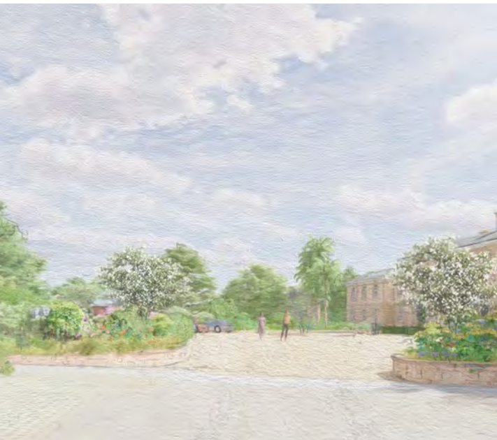
Proposed path linking the Garden entrance path to Camellia Walk