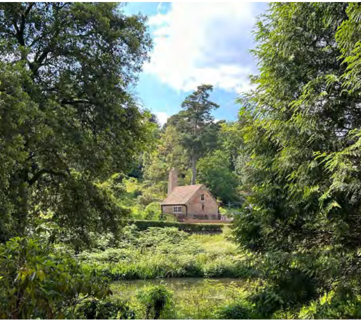
Reinstating the chimney to the Engine House