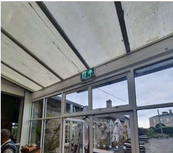
uPVC roofing to the clocktower cafe over historic timber frame