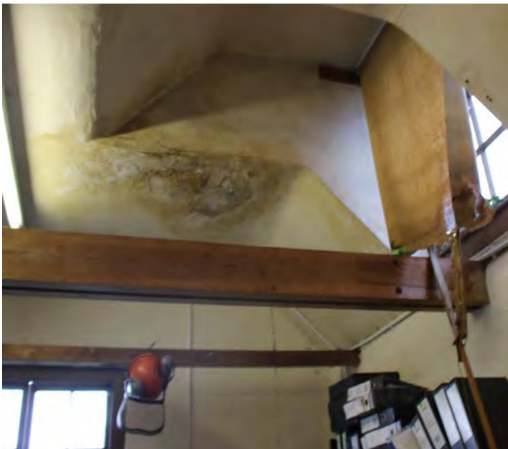
Redundant staff offices in need of repair to roof covering and internal finishes