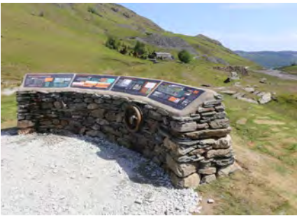
Interpretation board precedent