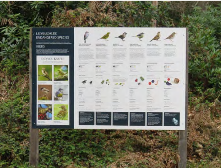
Existing interpretation board to the Lakes and Gardens