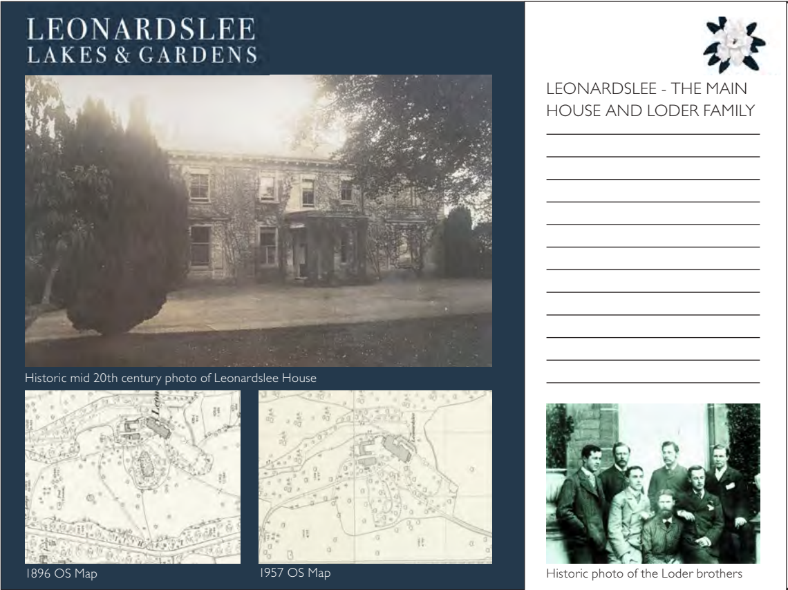
Indicative mock up interpretation board