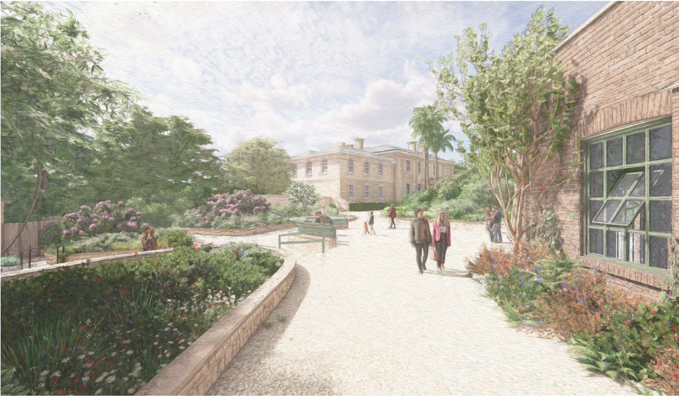
Visual of the view from Stable Lane

The overall proposal will offer a fresh experience and understanding of the Leonardslee Estate whilst enhancing its special historic significance.