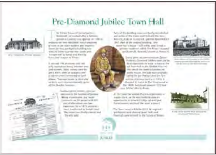
Interpretation board precedent