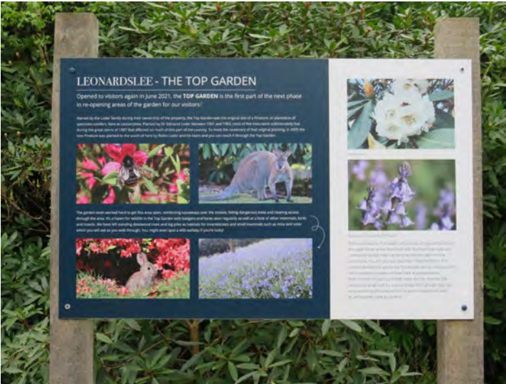
Existing interpretation board to the Lakes and Gardens

At present, there are useful and well presented interpretation boards throughout the Gardens, as seen in the below images. When it comes to the history of the Leonardslee House and the Loder Family this is not described in as much detail. As part of our proposals to the front of the House we are integrating new interpretation boards within the landscape scheme to match those already existing within the Gardens, see the adjacent mock up. There will be a general signage review across the Estate to ensure the signage is improving the visitor experience.