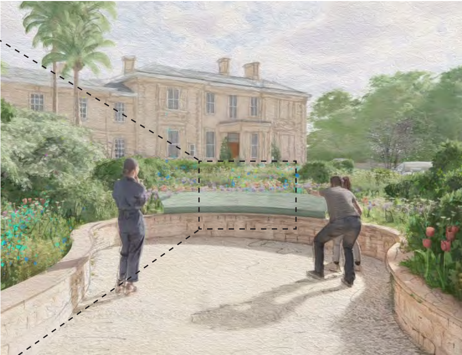
Proposed visual to the front of the Main House with location of interpretation board shown in red box