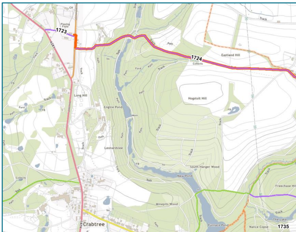
Figure 2.1 – Public Rights of Way in the area around Leonardslee estate