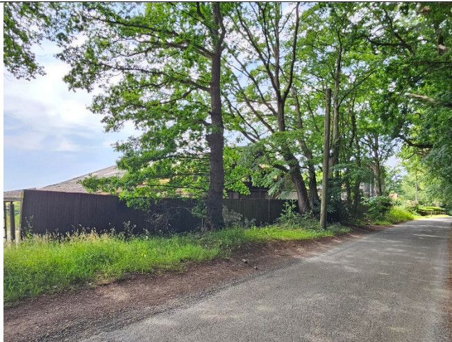
^Trees outside of the fence line.

It is also noted that the red line boundary for this phase has only changed for the BNG assessment, and not for the application as a whole. The red line boundary needs to be consistent throughout the application. In addition, as can be seen below, sections of hedgerow H1 are still within the 'new' red line boundary and must therefore be recorded as on-site as part of the baseline. The red line boundary does not appear to be amended to omit H8 either, and therefore this must also still be recorded in the baseline.