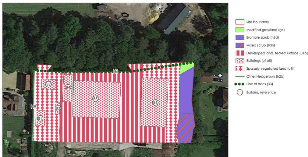
Original - BNG Design State Report (CSA Feb 2025)

It is also noted that the red line boundary for this phase has only changed for the BNG assessment, and not for the application as a whole. The red line boundary needs to be consistent throughout the application. In addition, as can be seen below, sections of hedgerow H1 are still within the 'new' red line boundary and must therefore be recorded as on-site as part of the baseline. The red line boundary does not appear to be amended to omit H8 either, and therefore this must also still be recorded in the baseline.