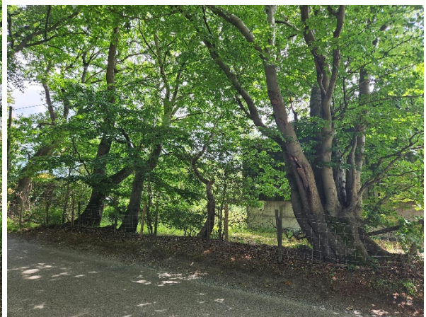
^Trees within the fence line.