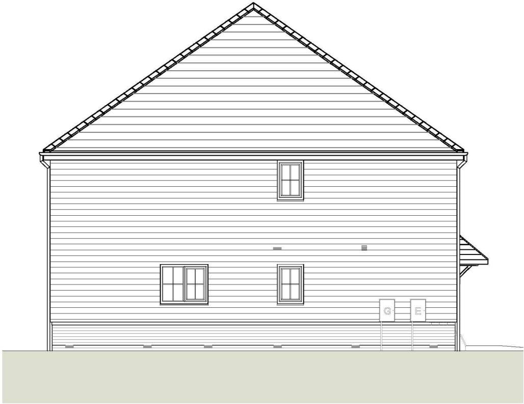
2 Gable Elevation 1 : 100