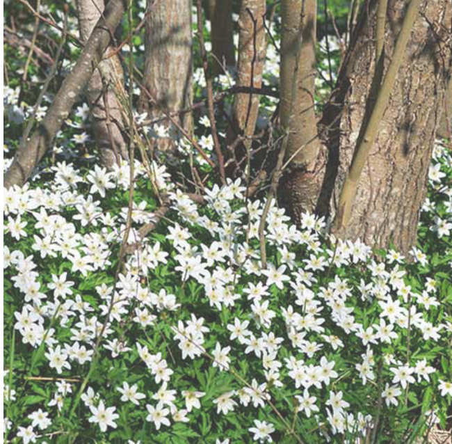
Anemone nemorosa (Wood anemone)