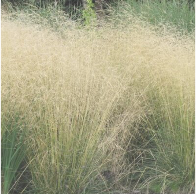
Deschampsia cespitosa 'Tufted Hair Grass'