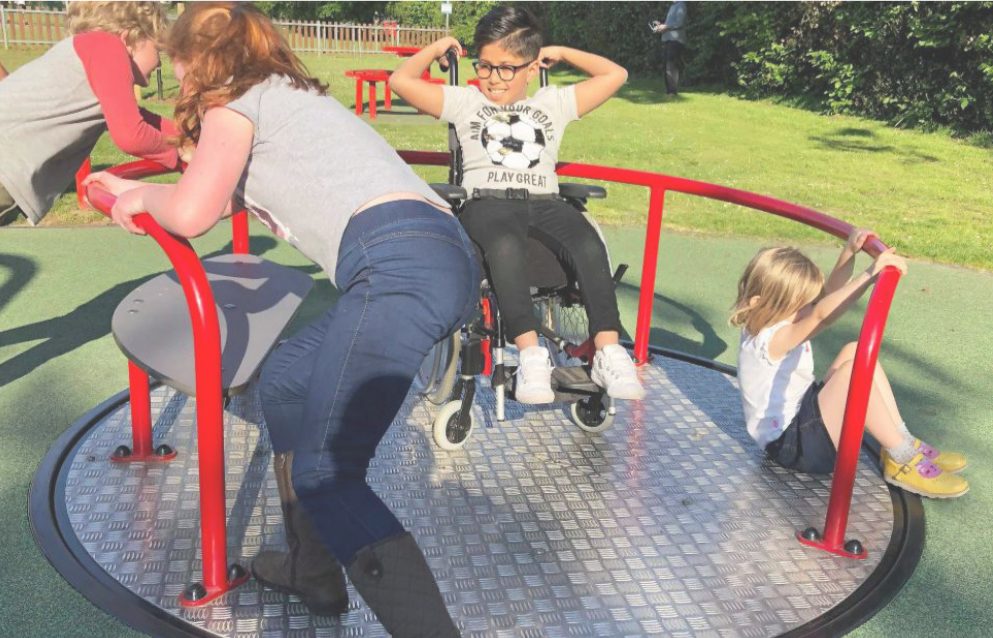
Wheelchair Carousel (PCM157) Inclusive Play