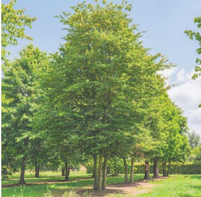
Carpinus betulus (Hornbeam)