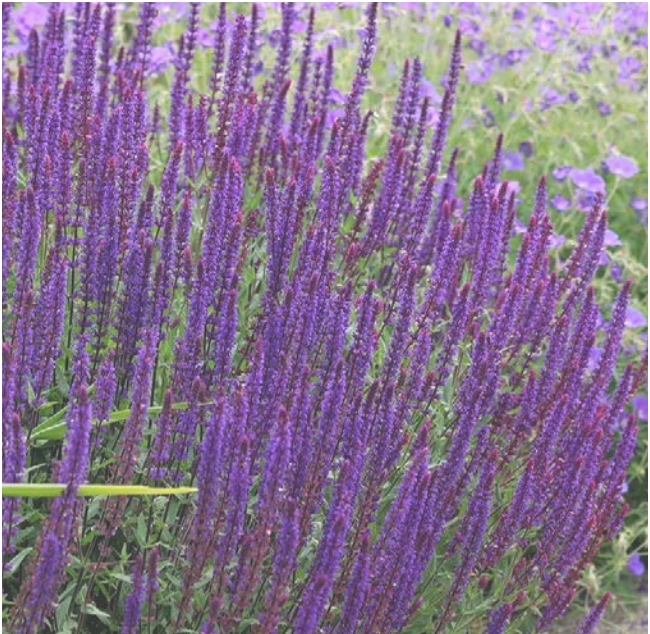
Salvia nemorosa (Balkan clary) 'Caradonna'