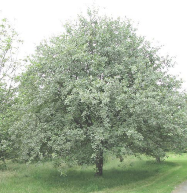
Sorbus aria (Whitebeam)