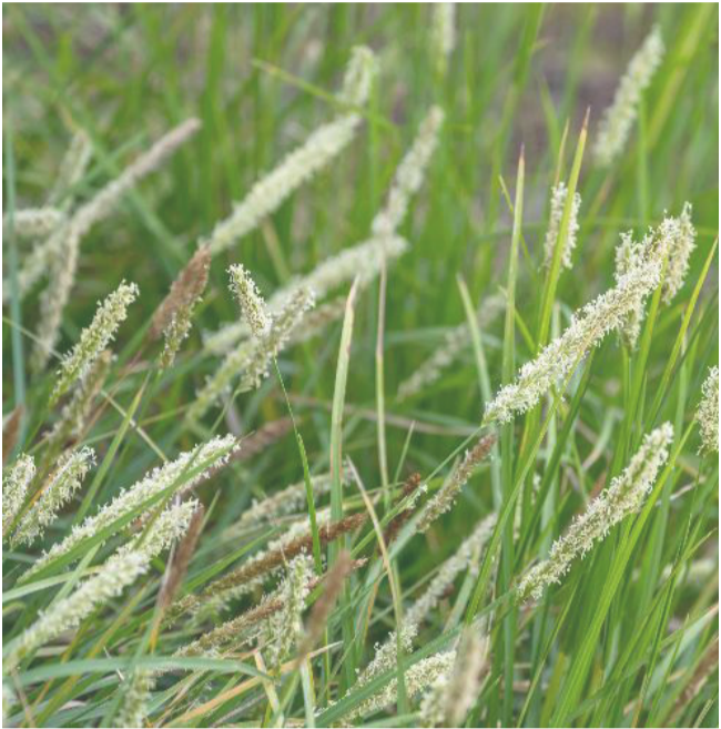
Sesleria autumnalis 'Autumn'