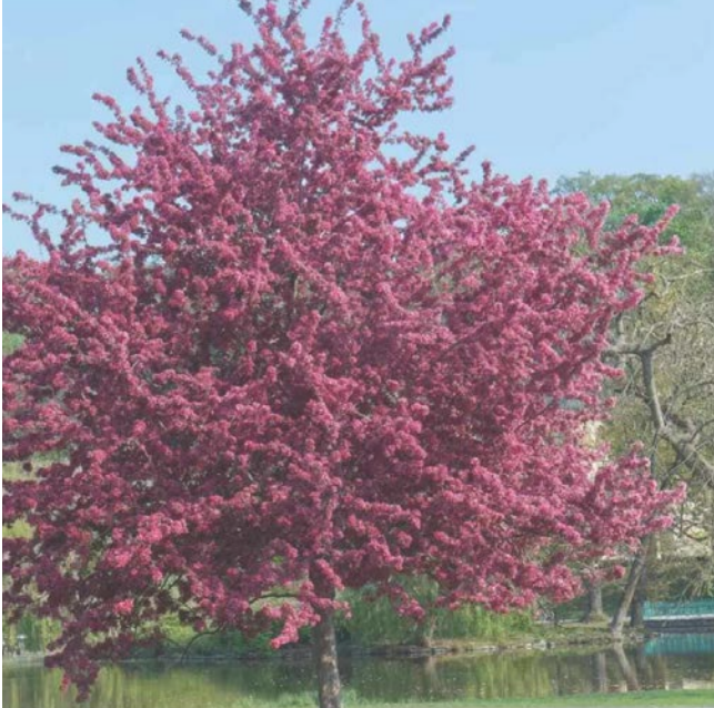
Malus sylvestris (Common crab apple)