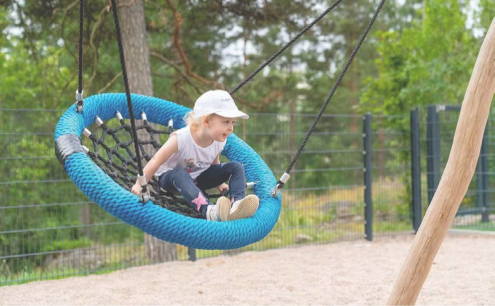
Swing Combination (NRO907)