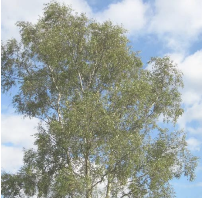
Betula pendula (Common silver birch)