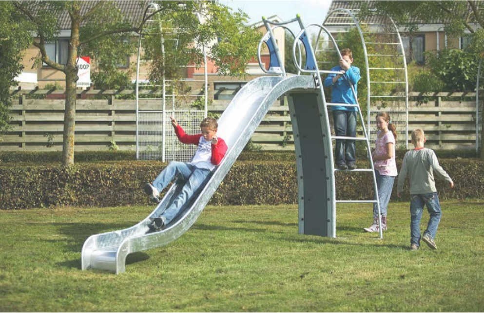
Slide with Climbing Wall (M333)