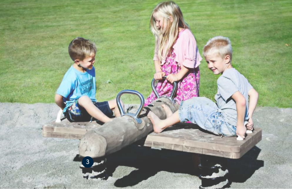
Butterfly Seesaw (NRO108)