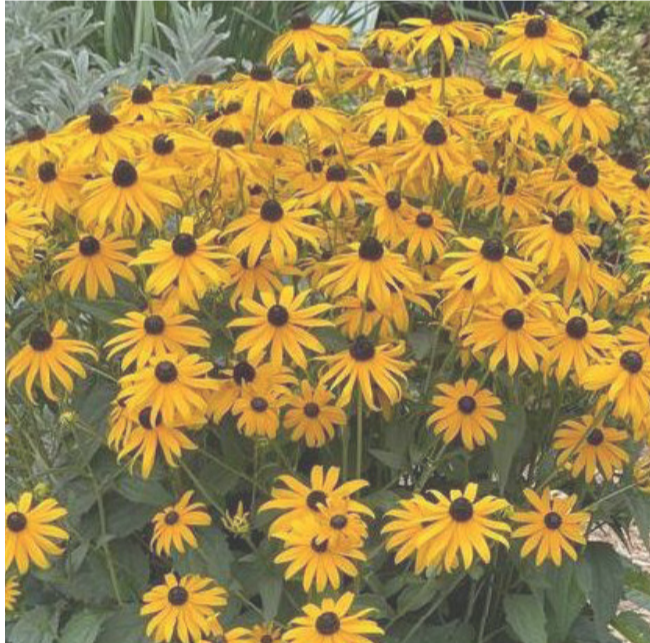
Rudbeckia fulgida sullivantii