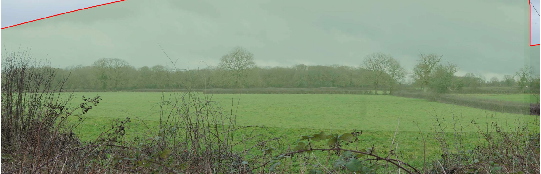
A3 Version of Viewpoint P3 - VVM year 1, without indicative planting (Munro Studios, 2020)