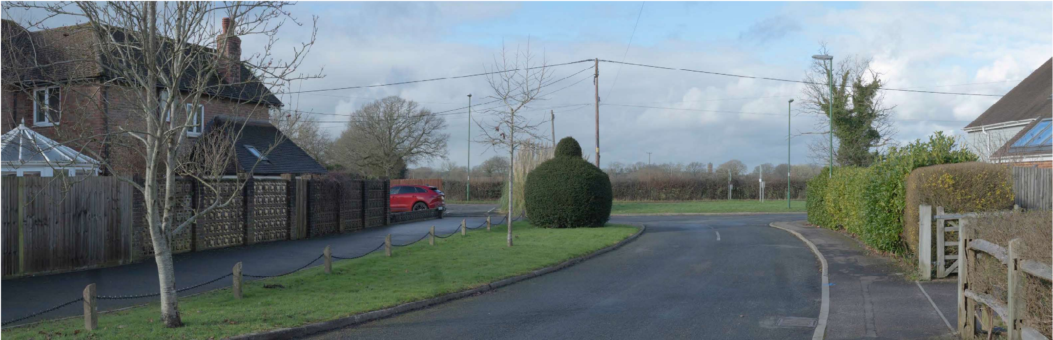
A3 Version of Viewpoint 21 - V116 base line (Munro Studios, 2020)