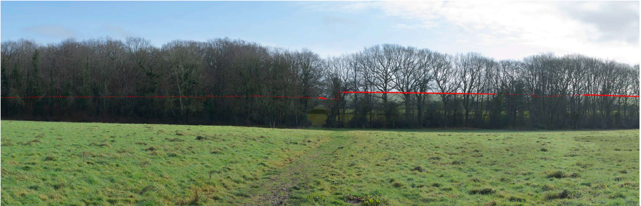
A3 Version of Viewpoint 10 - VVM year 1, without indicative planting (Munro Studios, 2026)