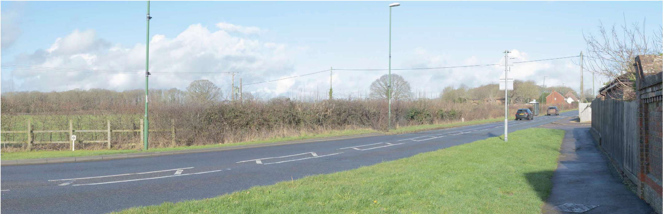
A3 Version of Viewpoint 18 - V1M baseline (Munro Studios, 2020)