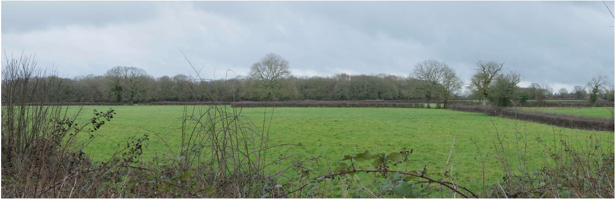
A3 Version of Viewpoint P3 - VVM base line (Munro Studios, 2020)