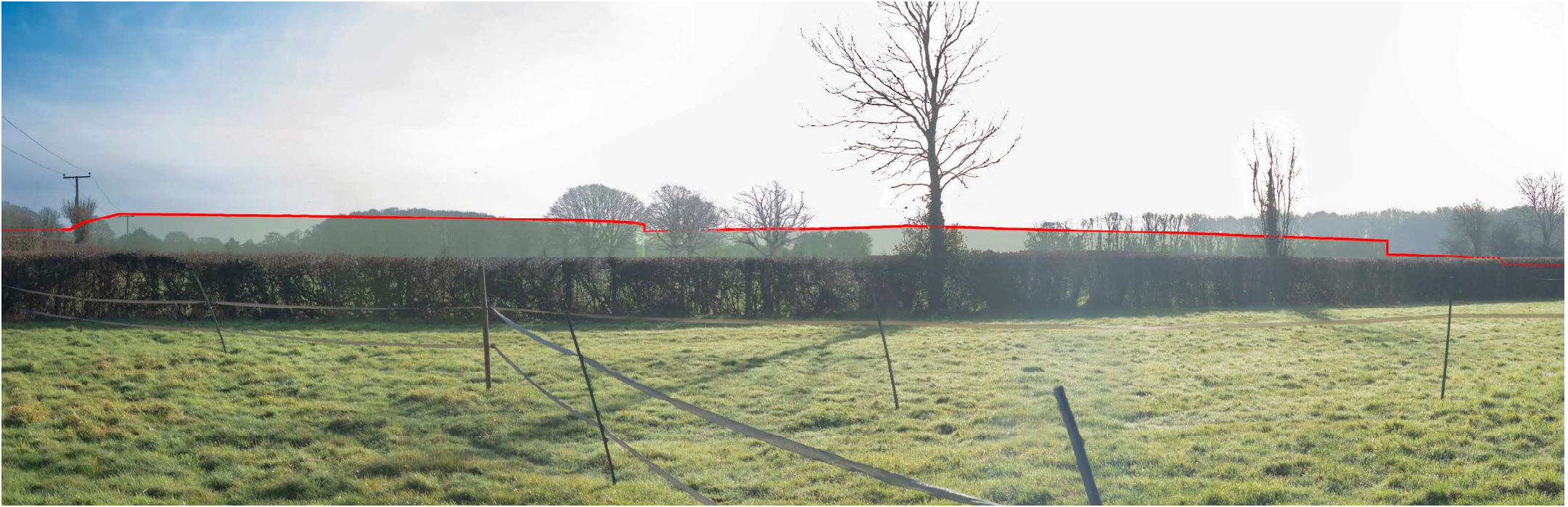
A3 Version of Viewpoint GA - VVM year 1, with indicative planting (Munro Studios, 2026)