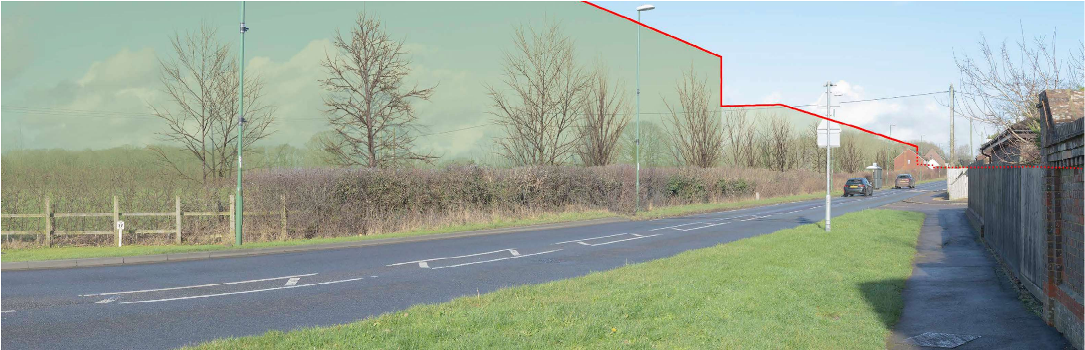
A3 Version of Viewpoint 18 - V18 year 15 (Munro Studies, 2020)