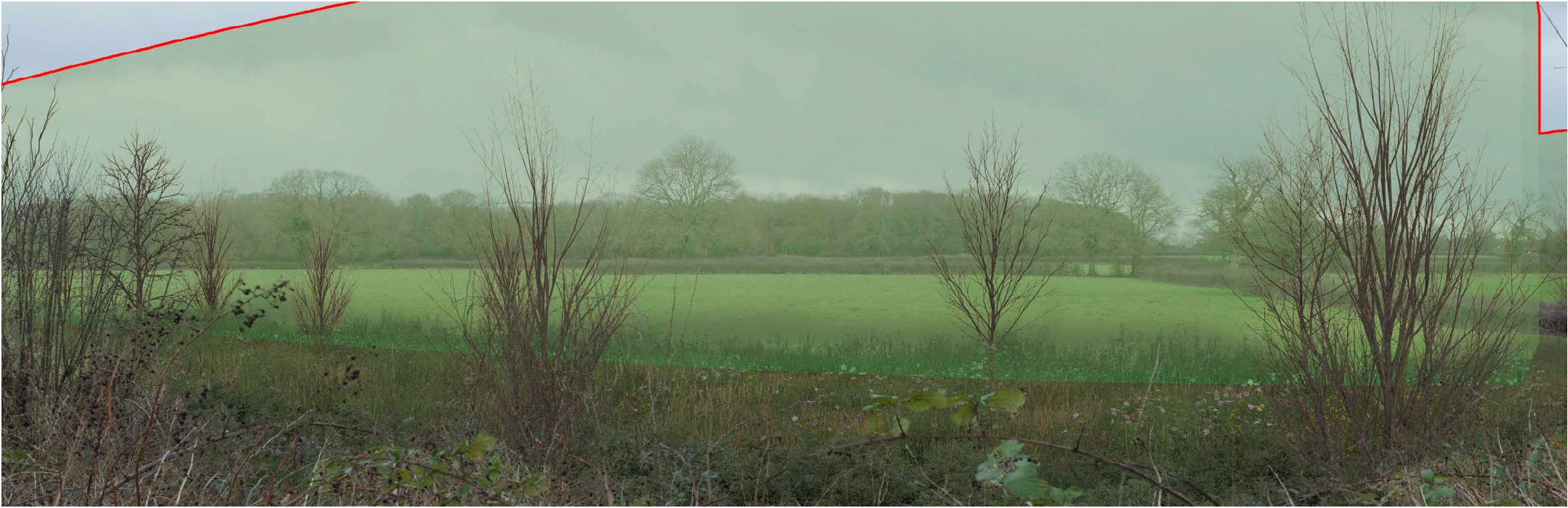
A3 Version of Viewpoint P3 - VVM year 1, with indicative planting (Mann Studios, 2020)