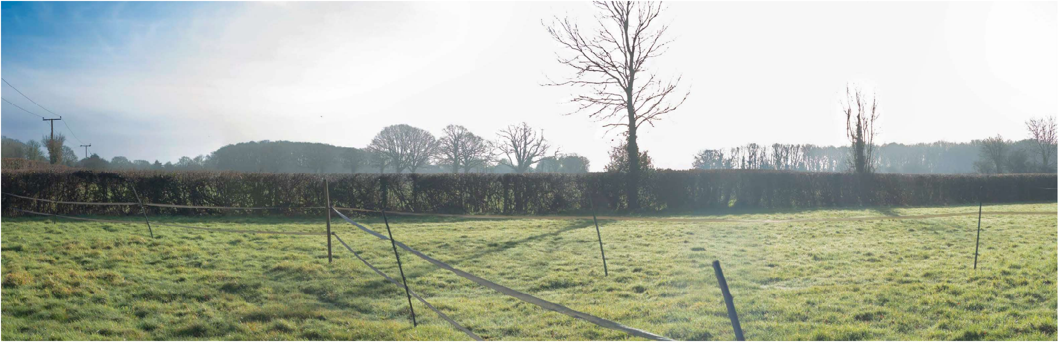
A3 Version of Viewpoint GA - VVM baseline (Munro Studios, 2026)