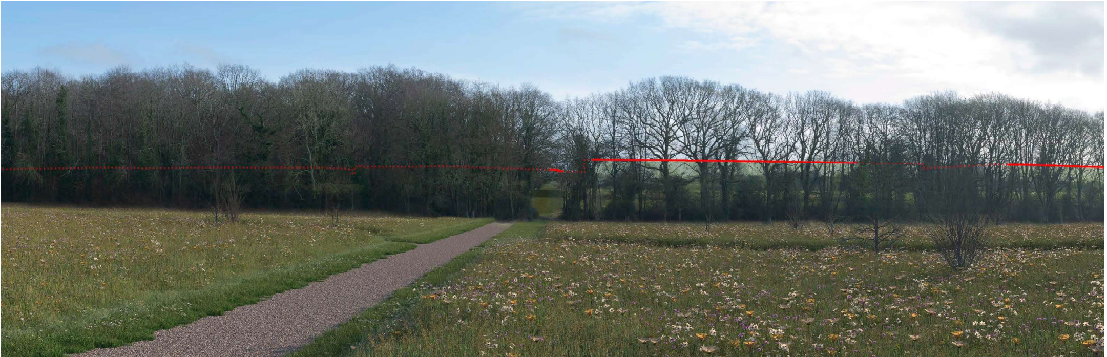
A3 Version of Viewpoint 10 - VVM year 1, with indicative planting. (Bluro Studios, 2020)