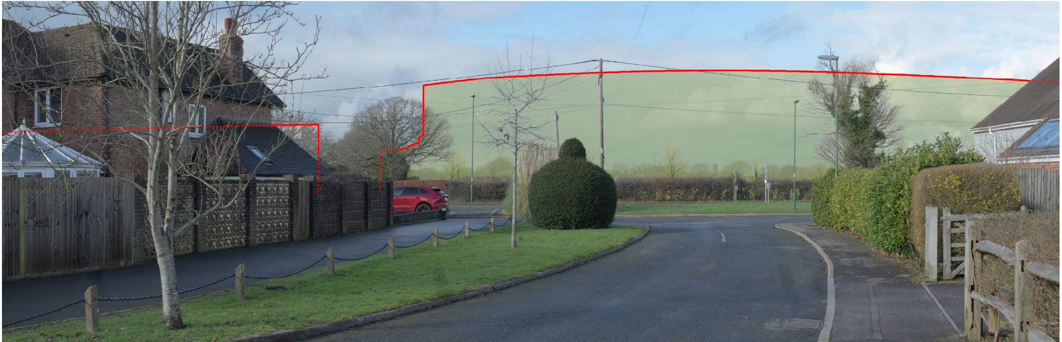
A3 Version of Viewpoint 21 - V16 year 1, with indicative planning. (Munro Studios, 2020)