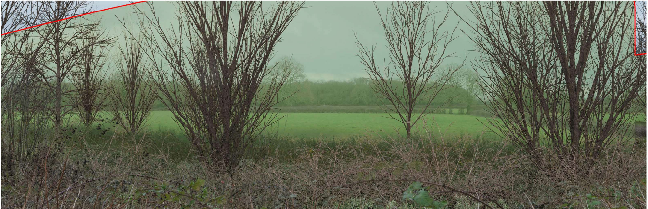
A3 Version of Viewpoint P3 - VVM year 15 (Murro Studios, 2020)