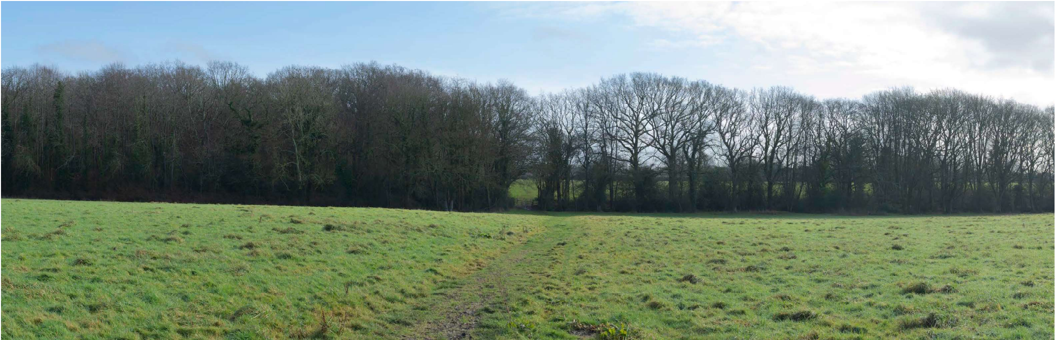
A3 Version of Viewpoint 10 - VVM baseline (Munro Skudron, 2020)