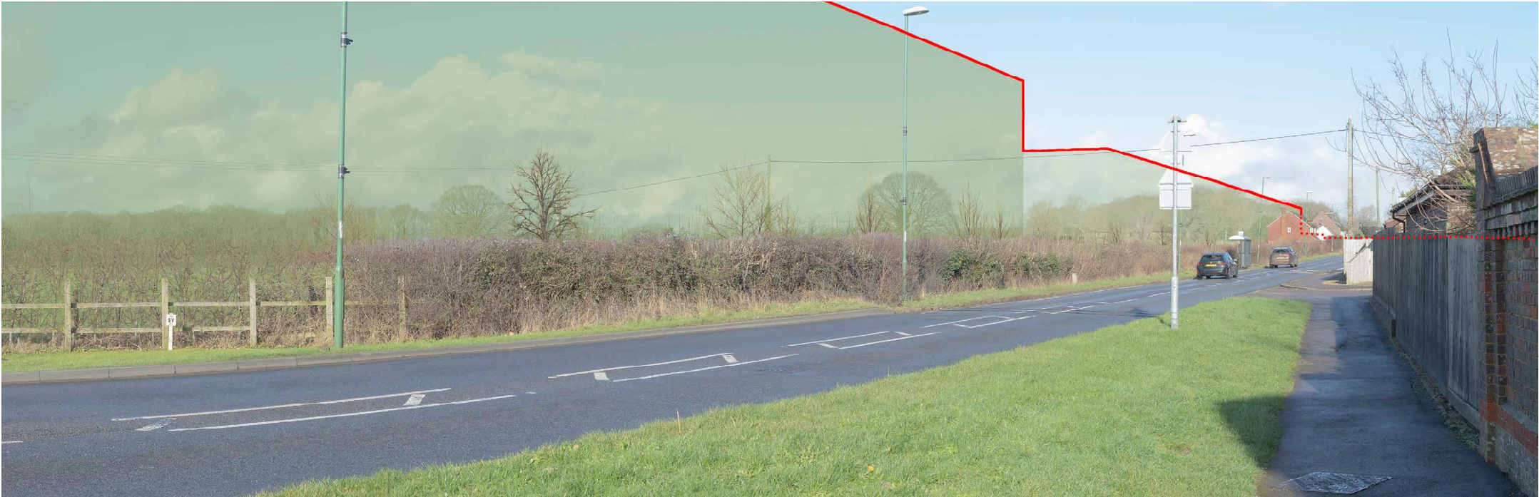
A3 Version of Viewpoint 18 - V18 year 1, with indicative planting (Munro Studios, 2026)