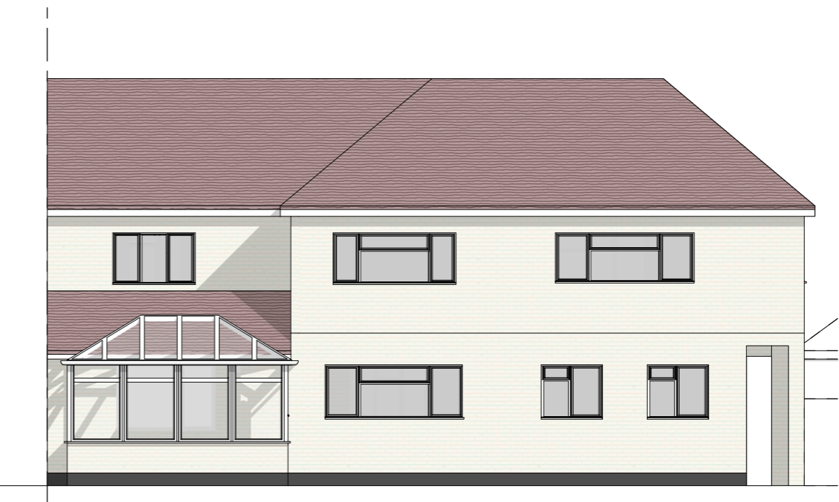
A :: Existing North East Elevation 03 scale: 1:100