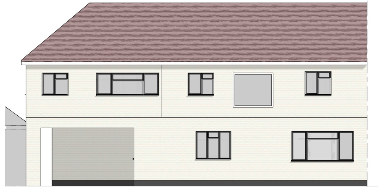
A :: Existing South West Elevation 03 scale: 1:100