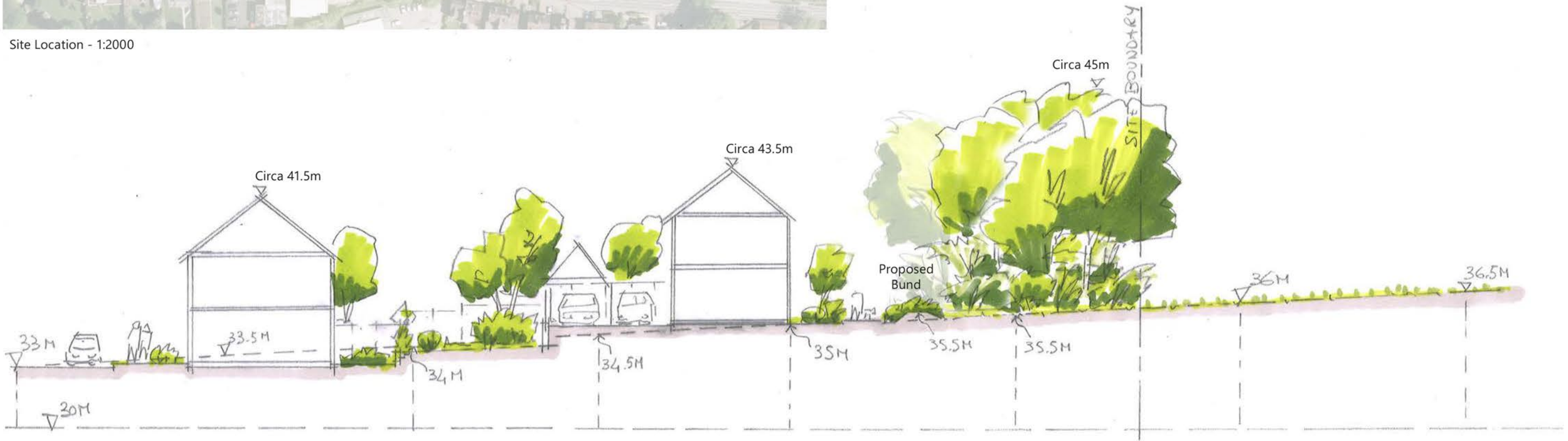
Section B/B - 1:200